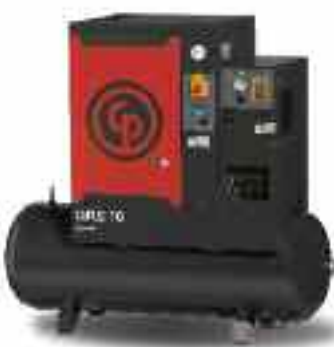
10HP ROTARY COMPRESSOR