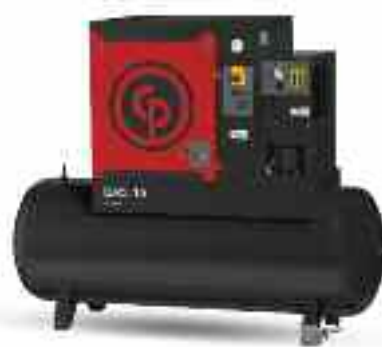
15HP ROTARY COMPRESSOR