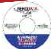
Card System CD