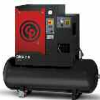
7.5HP ROTARY COMPRESSOR