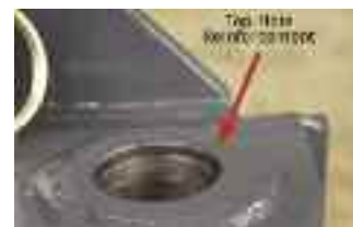
Carriage / Pin Hole