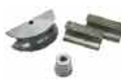
300-2 - 3" Die Package