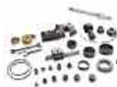
Fully equipped tool packages comes standard