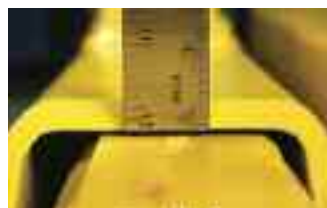
Lift Arm Top Plate Thickness