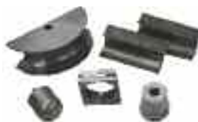
300-1 - 3" Die Package